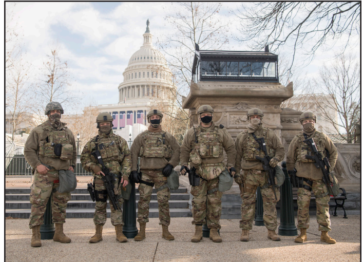
Virginia National Guard Airmen assigned to the 192nd Security Forces Squadron, 192nd Mission Support Group, 192nd Wing help to secure the grounds near the U.S. Capitol, Jan. 13, 2021, in Washington, D.C.