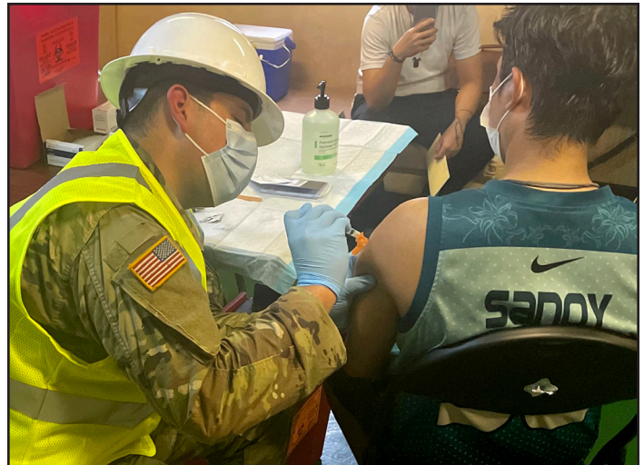
A Virginia National Guard Soldier administers a COVID-19 vaccination on board a ship June 22, 2021, in Norfolk, Virginia, as part of the VNG's ongoing mobile vaccination support mission.