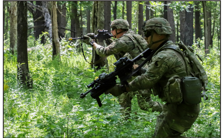
Soldiers assigned to the Lynchburg-based 1st Battalion, 116th Infantry Regiment, 116th Infantry Brigade Combat Team conduct squad attack lanes Aug. 6, 2021, at Fort Pickett, Virginia, in preparation for the upcoming deployment.

Soldiers will conduct training at Fort Pickett for about two weeks in August to accomplish a number of administrative and field training tasks to prepare for the mobilization including weapons qualification, equipment issue and medical evaluation. In the fall, they will report to Fort Bliss, Texas, for approximately 30 to 45 days of additional mobilization training before heading