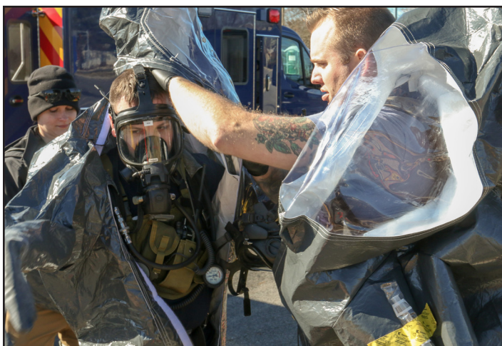
Members of the Virginia National Guard’s Fort Pickett-based 34th Civil Support Team suit up during collective lanes training Jan. 26, 2023, at the Virginia Beach Sports Center in Virginia Beach, Virginia.