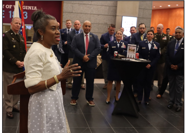
Virginia Lt. Gov. Winsome Earle-Sears commends the Virginia National Guard for the organization's service at a reception hosted Jan. 26, 2023, by the Virginia National Guard Association in Richmond, Virginia.