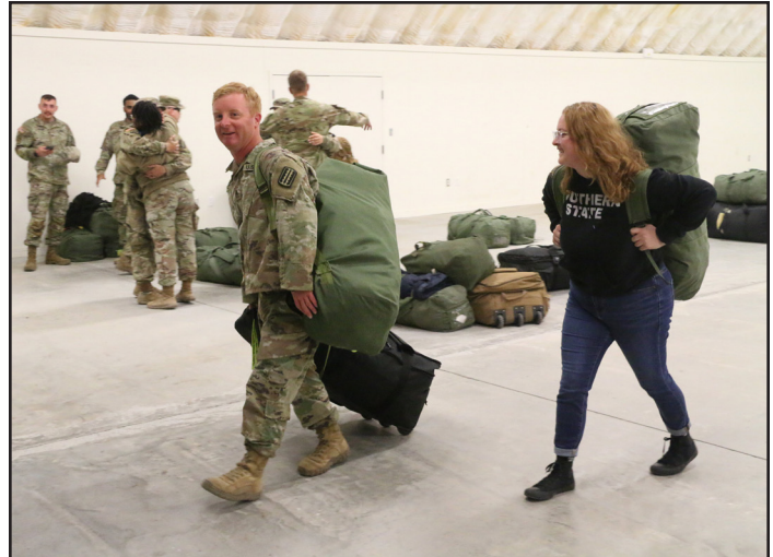
Virginia National Guard Soldiers assigned to the Virginia Beach-based 576th Engineer Utilities Detachment return to Virginia Feb. 10, 2023, after serving on federal active duty in Southwest Asia since May 2022.