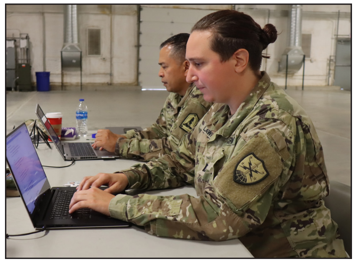
Virginia National Guard Soldiers assigned to the 91st Cyber Brigade and the Joint Force Headquarters - Virginia Defense Cyber Operations Element take part in Cyber Fortress 2.0 July 13, 2023, in Virginia Beach, Virginia.