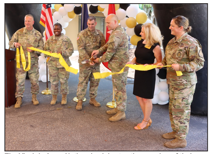
The Virginia Army National celebrates the opening of their new Roanoke-area recruiting storefront with a ribbon cutting and open house Aug. 12, 2023, in Roanoke, Virginia.

Wynn emphasized to the attendees that "everyone is a recruiter" and talked about how Virginia residents can earn $1,000 with the