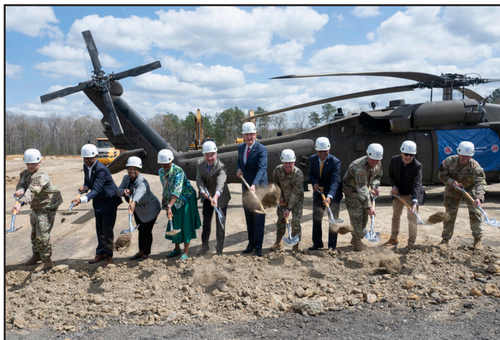
State and federal elected officials along with Virginia National Guard and community leaders ceremonially break ground on a new Army Aviation Support Facility March 31, 2025, in Sandston, Virginia.

The current facility employs 90 full-time personnel, 430 traditional status National Guard Soldiers, and houses a fleet of